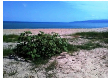
Angitola river dunes conservation.

Do they work individually or as part of a group?/What is their position/What is the focus of their environmental interest: