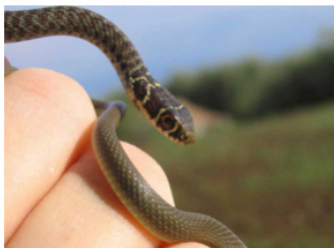
Snake conservation and human-snake conflict mitigation.

Please include photos of relevant information: