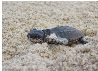
Sea turtles protection.